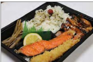
#5 Salmon Shioyaki, Chicken Teriyaki, Shrimp Tempura (1 pc.) & Gobo $9.50