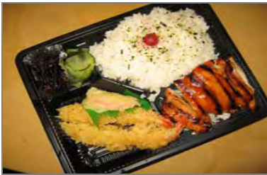
#3 Shrimp Tempura (2 pcs.) & Chicken Teriyaki $7.40