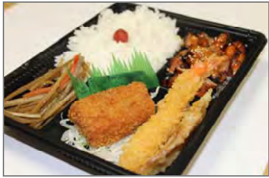
#7 Breaded Ahi, Chicken Teriyaki Tempura (1 pc. Shrimp, 1 pc. Sweet Potato) & Gobo $9.50