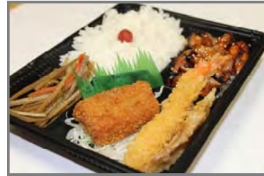
#7 Breaded Ahi, Chicken Teriyaki Tempura (1 pc. Shrimp, 1 pc. Sweet Potato) & Gobo $9.50