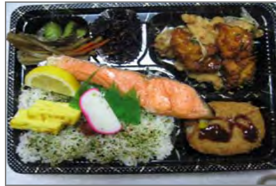
#4 Salmon Shioyaki, Vegetable Croquette & Chicken Karaage w/ Sweet Sesame Sauce $9.95