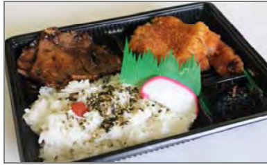
#1 Chicken Katsu & Beef Teriyaki $7.75