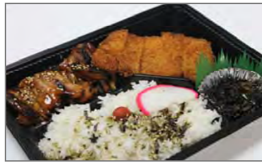
#2 Chicken Teriyaki & Tonkatsu (Pork) $7.40