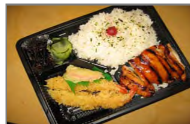
#3 Shrimp Tempura (2 pcs.) & Chicken Teriyaki $7.40