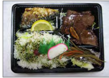
#8 Saba Shioyaki, BBQ Short Ribs & Gobo $9.20