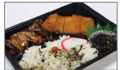
#2 Chicken Teriyaki & Tonkatsu (Pork) $7.40