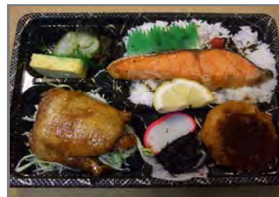
#9 Shoyu Chicken, Salmon Shioyaki & Vegetable Croquette $9.95