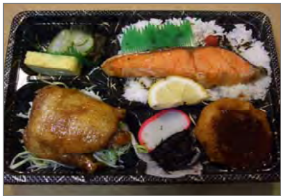
#9 Shoyu Chicken, Salmon Shioyaki & Vegetable Croquette $9.95