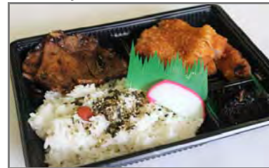
#1 Chicken Katsu & Beef Teriyaki $7.75