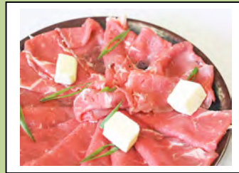
Shabu Shabu - Beef

Served with Our Special Sauces, Soup, Rice & Tsukemono