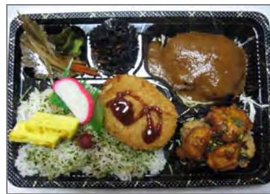
#10 Hamburger Steak w/ Gravy, Vegetable Croquette & Chicken Karaage w/ Sweet Sesame Sauce $9.95