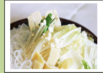
Shabu Shabu - Vegetables