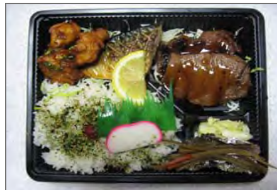
#6 Saba Shioyaki, Beef Teriyaki, Fried Chicken & Gobo $9.50