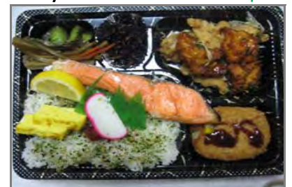
#4 Salmon Shioyaki, Vegetable Croquette & Chicken Karaage w/ Sweet Sesame Sauce $9.95