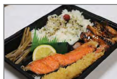
#5 Salmon Shioyaki, Chicken Teriyaki, Shrimp Tempura (1 pc.) & Gobo $9.50